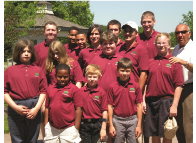
North Ohio Hemophilia